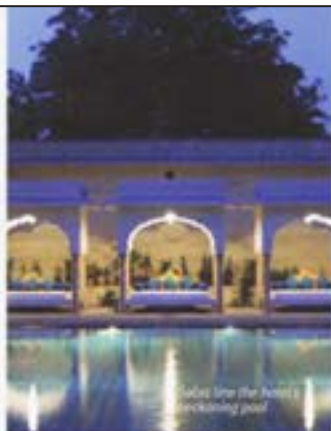
Along line the Haveli's reflecting pool

A foodie must-do: delight in a candlelit dinner in the leafy courtyard at Samode Haveli. Start at dusk with a glass of wine; then dig into the house specialty, raan-e-samode , an overnight-marinated leg of lamb roasted over charcoal. Be sure to order the dish one day in advance.