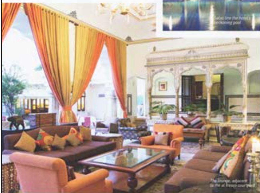
The lounge, adjacent to the at fresco courtyard